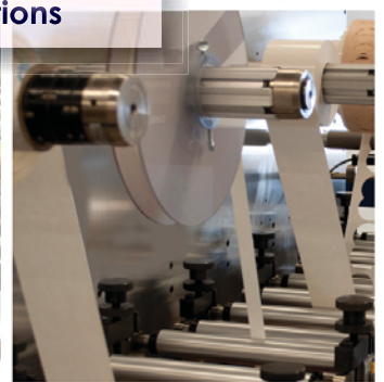
Complex lamination and placement